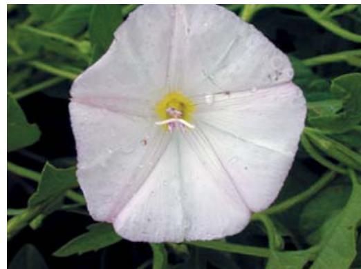
Above: PHOTO COURTESY Ronald Calhoun ( www.msuturfweeds.net ).

Grazing: Field bindweed is not palatable, but may be consumed in severely overgrazed pastures. Hay contaminated with large amounts