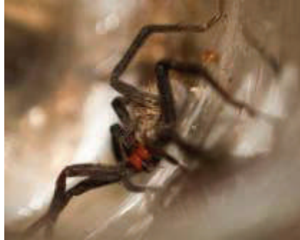
A photo of the wandering spider which arrived at Assiniboine Park Zoo.

Norquay and Gary Ruczak) experienced in maintaining spiders. Until its identification could be confirmed, it was treated as a potentially dangerous specimen. When offered a cricket as food, the spider instantly captured and then devoured the insect, so the spider appeared to be in good health after its long journey.