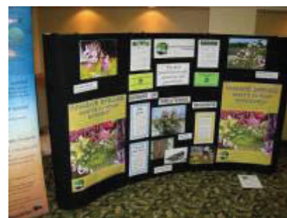
ISCM's Display at the AGM & Workshop