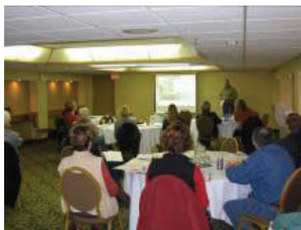
Attendees of the Stakeholder's Workshop.

Topics discussed included an Introduction to Risk Analysis and the Federal Approach, Provincial considerations and Use, Introduction to the Canadian Weed Risk Assessment, and Weed Risk Assessment Demonstration.