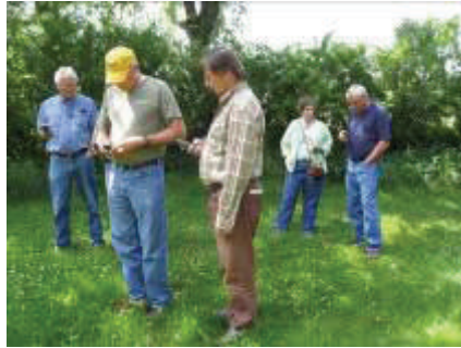
Weed Supervisors collecting GPS data during an ISCM Workshop.

include a description of the region – geographically and in terms of land use & economy. This information aids in determining what species are best focused on and whether they need to be controlled or eradicated.